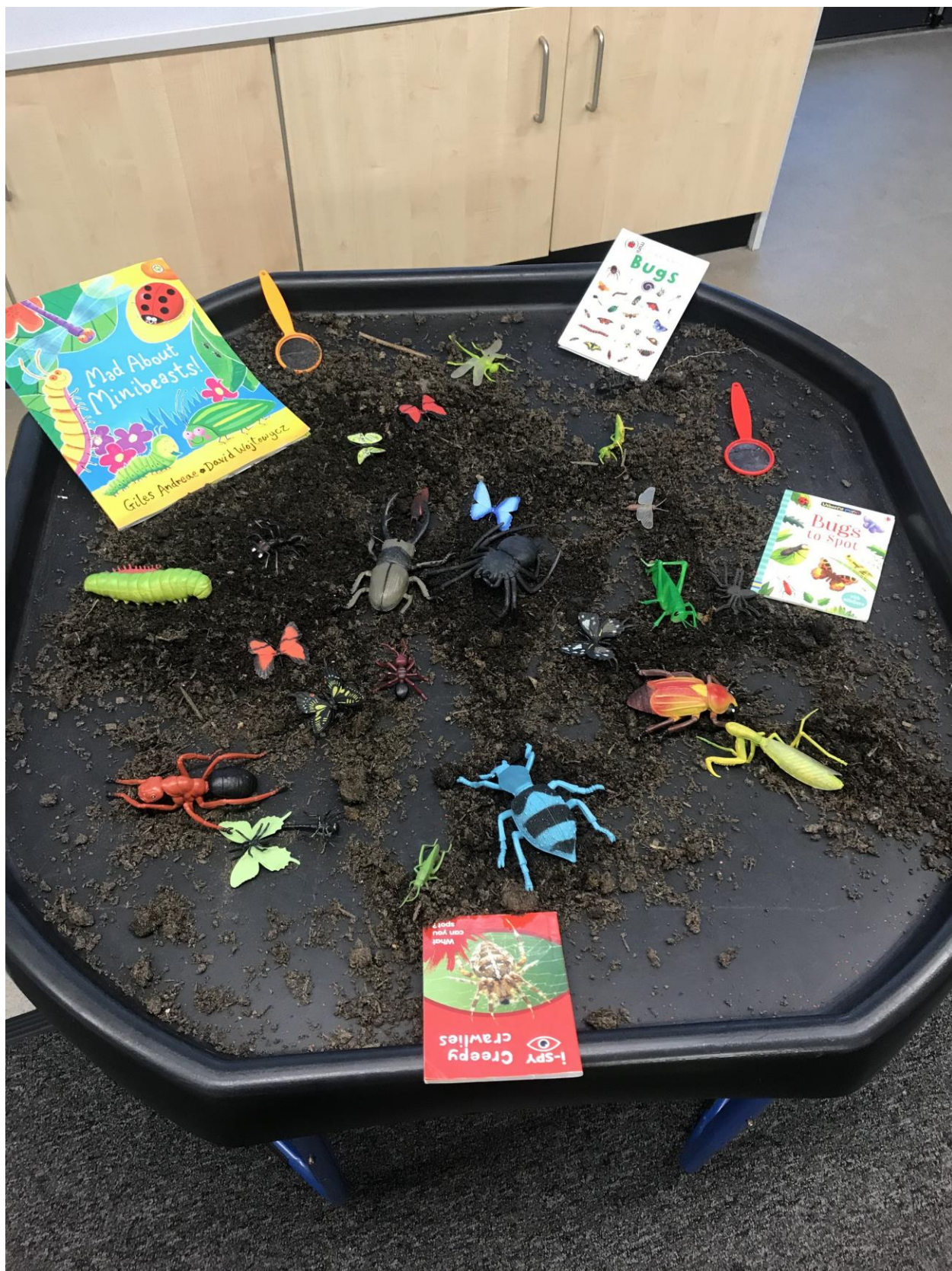
Our Reception Early Years environment is ready for continuous provision, learning and exploring.