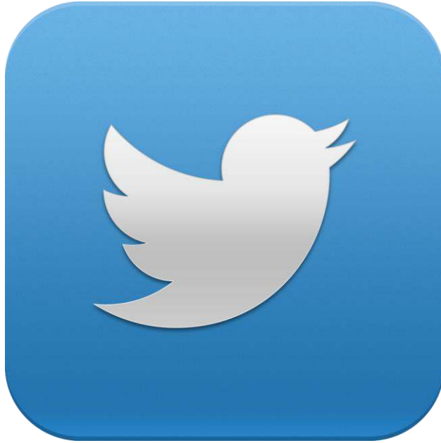
5 - TWITTER